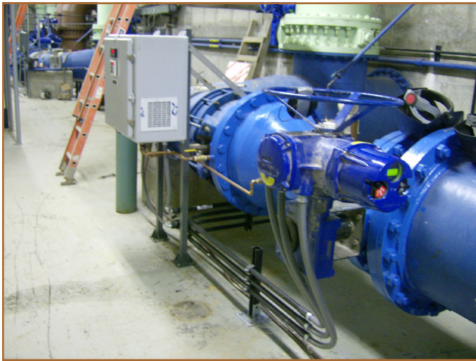
Figure 5. As part of the improvements, automated valves were installed and connected to the instrumentation network.

After considering alternative vendor offerings, OCWA's project team decided upon the NET Concentrator System® (NCS) from Moore Industries. This smart I/O system takes advantage of "cable-concentrating" technology, which eliminates point-to-point cable, conduit and wire trays by sending process monitoring and control signals between the field and control room on a single digital communication link. The system provides true signal isolation, with isolated modules for both analog and digital I/O. All discrete and analog signals are digitized, packetized and communicated via Ethernet