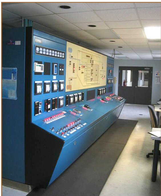
Figure 3. Original analog control system at Otisco Lake Water Treatment Plant, Onondaga County Water Authority.

In addition, OCWA wanted to reduce wiring and instrument maintenance costs at its water treatment facility. This would require the elimination of multiple long cable runs between sensors, actuators and controls, and a solution for collecting multiple sensor/control pairs near their point of installation. Such an approach would do away with hundreds of previously installed twisted pairs, cable trays, complex wiring diagrams, and associated maintenance.