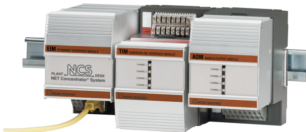
Figure 6. Moore Industries' NET Concentrator System (NCS) provides a solution for Distributed I/O and Remote I/O.

communications using standard Ethernet cables, LAN switches and routine Ethernet hardware (Figure 6). The Distributed I/O and Remote I/O System functions as a universal signal gateway that interfaces with OPC-compatible DCSs or PLCs, and works over 10/100Base-T Ethernet (MODBUS/TCP) and MODBUS RTU networks. The system includes a communications module plus multiple I/O modules. Each I/O module supports multiple analog or discrete channels that interface to remote sensors, switches, actuators and displays. Each analog input channel incorporates its own 20-bit A/D input. This guarantees that no resolution from the existing analog transmitters will be lost when the signal is transmitted over the Ethernet network to the host system.