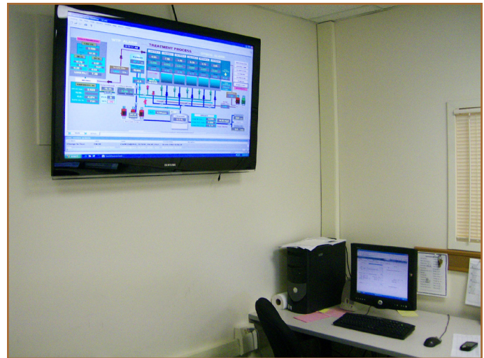
Figure 4. Process functions are now controlled through a PC/PLC-based control system.

Key to the control system upgrade was the implementation of Distributed I/O and Remote I/O—specifically a solution employing isolated I/O modules to eliminate signal loop interference on the Ethernet control network. This would stop ground loops and signal aberrations at any location from affecting other measurements in the facility. Digital communications, in place of analog signals, also eliminates sensor and control signal degradation (and associated calibrations) and cross communication (noise) commonly associated with “analog-only” communications.