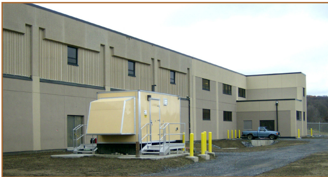
Figure 1. OCWA's water treatment plant in the town of Marcellus, New York, has undergone infrastructure improvements designed to enhance its overall performance.

Water first enters the Rapid Mix tank where a coagulant (polyaluminum chloride) and a taste and odor control chemical (powdered activated carbon) are added. After 30 seconds of mixing, the water enters the Contact Basins where calm conditions allow the coagulant to make small particles adhere together to form larger particles. Some of these particles settle and are cleaned out later. The contact time in the basins also allows the powdered activated carbon (used during times of high algae growth in the lake) to absorb organic taste and odor causing chemicals.